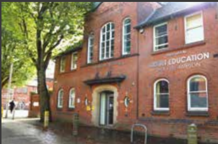
Alan Garner Building (including rooms in the library)

Adult Education Wolverhampton City Learning Quarter Old Hall Street Wolverhampton WV1 3AU