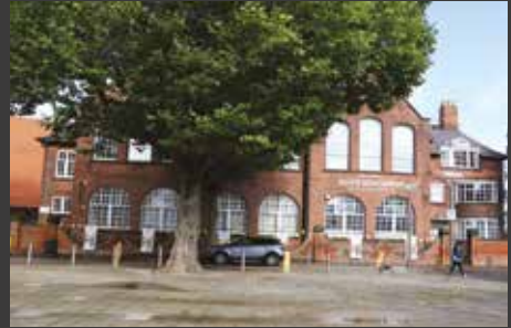
Old Hall Street Building